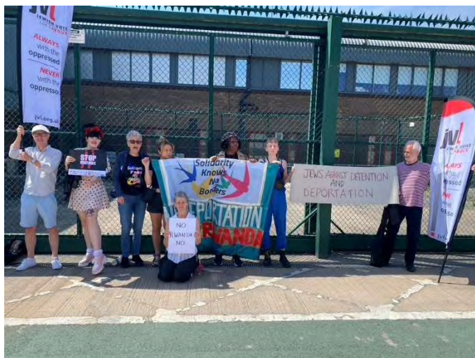
GMJVL at Detention Centre protest

The creation of a GM JVL WhatsApp group, agreed at the AGM, has proved to be a really useful tool for sharing events and resources and co-ordinating our presence at such protests.